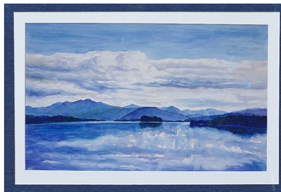
"Lake Pleasant", watercolor painting by LPSA member Kit Fairchild.