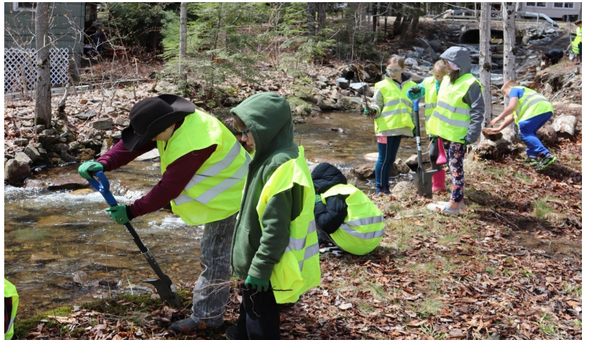
Students plant trees along Warner Brook

were reviewed by a panel of LPSA representatives. The lower grades all participated in a program co-sponsored by LPSA and the Hamilton County Soil and Water Conservation District (HCSWCD), which now is a member of our Board of Directors. The lower grade students are being exposed to the concepts of erosion and its prevention along with pollution of our lakes and streams through a hands-on experience. Students helped plant hundreds of trees to help hold soil in place in an area where flooding had