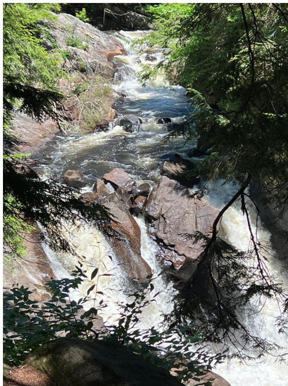
Left—Beaver Pond, Right—Auger Falls,