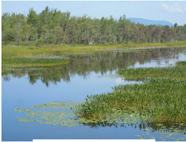
View from Route 8 bridge

The Town of Lake Pleasant and the Village of Speculator along with other nearby Adirondack communities (e.g., Piseco, Inlet...) are considering and implementing changes to ensure that septic systems are not feeding excessive nutrients into our water bodies. Our lakes are clean and continue to be monitored for active pollutants that could come from direct sewage; however, despite historic town laws allowing for County testing and inspection of systems, only new systems are currently being inspected to ensure that they are up to code. This leaves a potential gap where existing systems may be partially functioning but letting significant nutrient additions into the lake and potentially "feeding our weeds". All parties understand the importance that our lake quality has on recreation, ecology and our economy and therefore want to do the right thing. Previous attempts to extend the existing Village sewer system have not been successful, essentially due to cost distribution and are not in active consideration. The focus locally is on how to fund and how to prioritize testing and inspections on legacy sys-