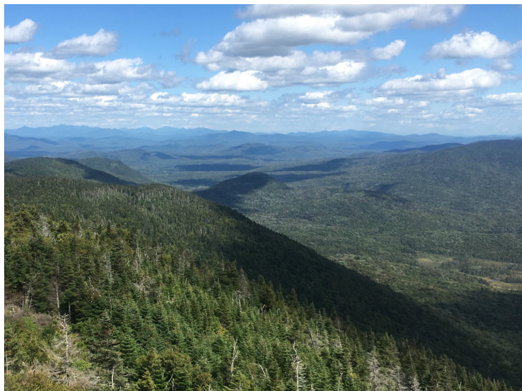
View from Wakely Mountain Fire Tower

Lake Pleasant-Sacandaga Association PO Box 164 Speculator NY 12164-0164