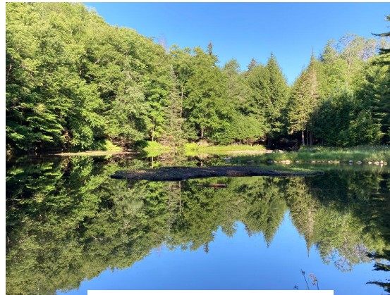
Pond on Gilmantown Road

LPSA to have their staff members inspect all boats being launched from their facilities. Lake Pleasant Marine has also been very cooperative, working with LPSA to inspect boats being launched at their ramp. Unfortunately, the marina personnel are so busy on summer weekends that they have found it difficult to properly inspect all boats launched at their ramp on Saturdays and Sundays. Hence, LPSA is providing funding to hire a Lake Steward to monitor that ramp on weekends, to supplement the inspection work done by marina personnel. These added Lake Stewards will further help to reduce the possibility of dangerous invasive species finding their way into our healthy lakes.